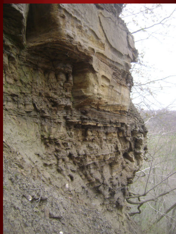
Vermillionville Sandstone at Matthiessen State Park